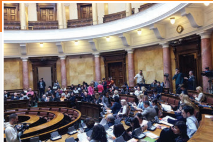
Public debate, National Assembly of the Republic of Serbia 7th of March 2014