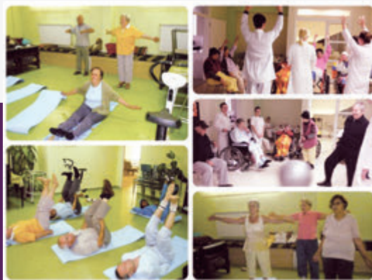
ACTIVITIES IN RUHAMA