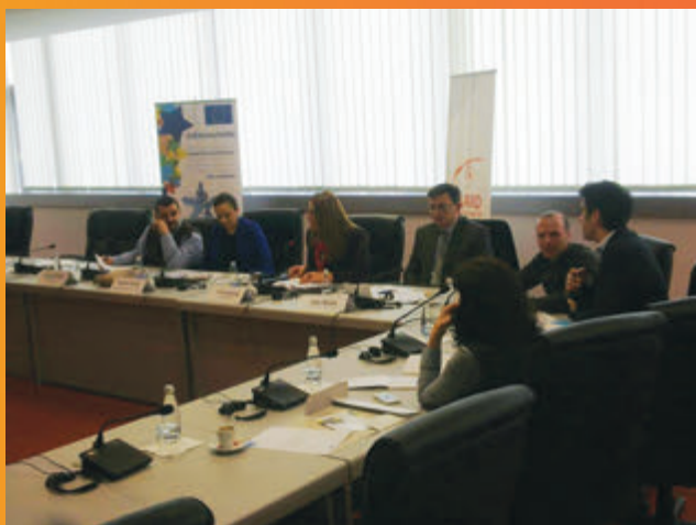
Open debate in Prishtina, 13th of February 2014. Governmental Building of Kosovo