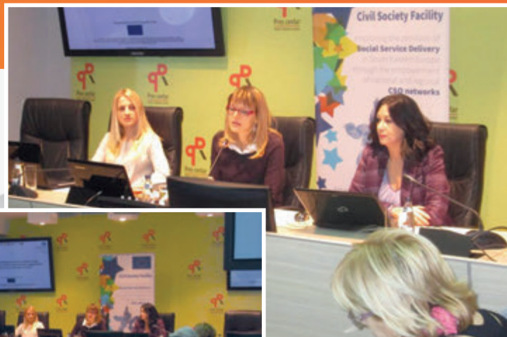
Inaugural Meetings for the National network of Montenegro, 30th of November 2013. Podgorica